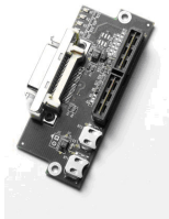
Figure 1: XRM-CAMERALINK Module

The XRM-CAMERALINK is a front panel adapter card primarily designed for use with Alpha Data's ADM-XP, ADM-XRCII and ADP-XPI FPGA-based cards. It provides the connectivity between the FPGA card and the industry standard "CameraLink" digital camera interface. It provides the user with the ability to implement computationally-intensive applications such as frame grabbers, digital video communications and image processing systems in FPGA fabric when utilising this type of camera.